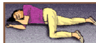
The Recovery Position