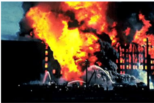
Bradford City FC during the blaze