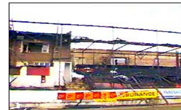
Bradford City, hundreds of people in hospital with burns, 52 people died

Course duration is 2 hours and includes the types of fire & which extinguisher to use. Maximum group size is 15 delegates. Attendance certificates will be issued to all delegates