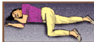
The Recovery Position