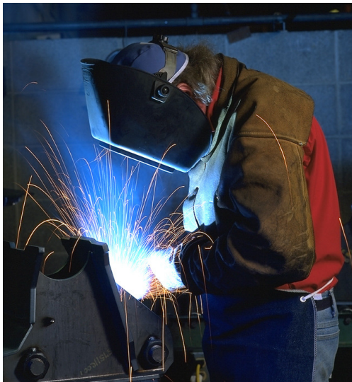
Safe Systems of Work

Candidates are assessed on the basis of two course assignments and a three-hour written paper. The final pass mark is 60%. Those who gain a mark of 80% or more are awarded a credit certificate.